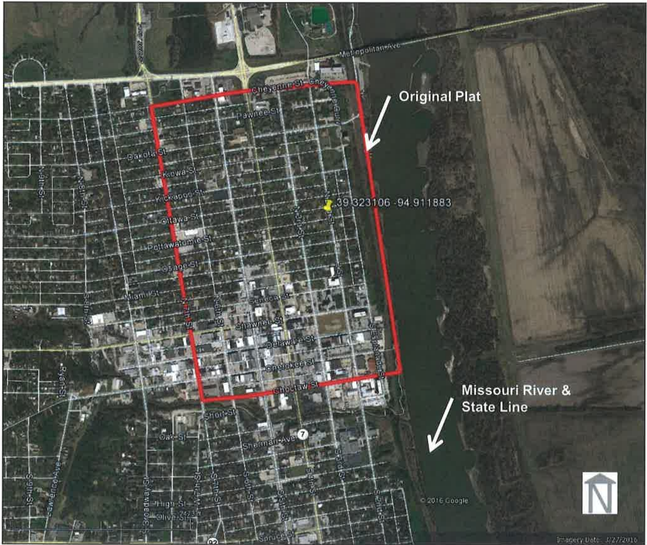
Figure 1. 2016 Google Aerial image, showing the Giles House within the original Plat of Leavenworth.

Leavenworth, Leavenworth County City and County