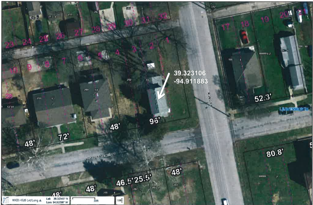
Boundary Map. 2014 Aerial image, showing the Giles House on lot two, Of block 28 of the original plat of Leavenworth.

Leavenworth, Leavenworth County City and County