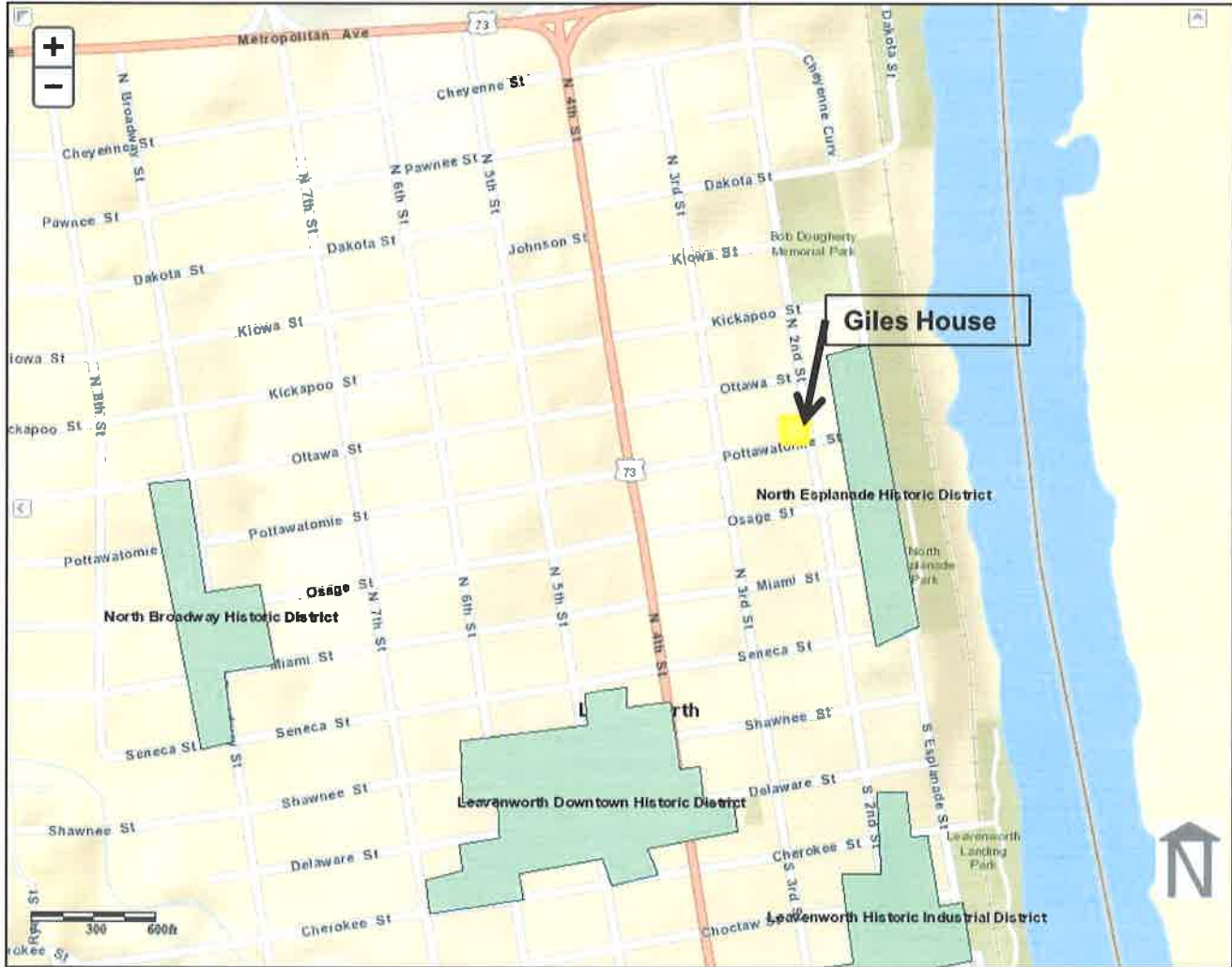
Figure 2. 2016 Google Aerial image, showing the Giles House within the original Plat of Leavenworth.

Leavenworth, Leavenworth County City and County