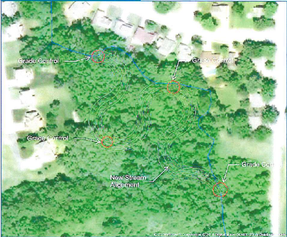
Figure 28. Proposed streambed realignment for option 2