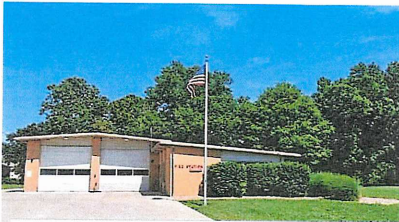
Fire Station #3 was built in 1965. At the time, ADA and separate gender facilities were not considered. Additionally, the facility continue to experience drainage and sewer problems.